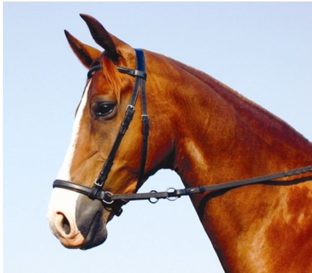
Figure 1: Showing the correct fitting for the crossunder bitless bridle on an adult Tennessee Walking Horse, with the noseband low and snug.

This article has three objectives. First, to explain where bone stops and cartilage begins (see legend # 3 on Fig. 2). Secondly, to show that the crossunder bitless bridle is uniquely compatible with the physiology of the horse at exercise. Thirdly, to provide an introduction to some of the form and function reasons (anatomical and physiological reasons) why the bit method of communication is contraindicated and counterproductive (Cook 1999a, 1999b, 2000, 2002, 2003a & b, and Cook & Strasser 2003). The objectives can be most conveniently achieved by a study of Figures 1 to 3.