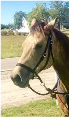
Amber, September 10, 2016 Tried our bitless bridle today and NO HEADTOSSING! Very happy!